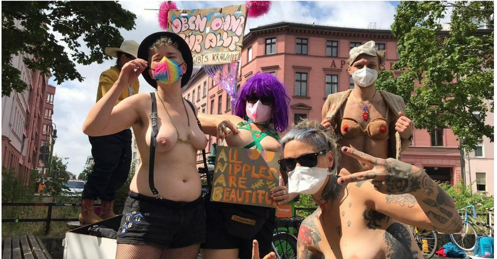
Various Actions and Performances in Public Space with all kinds of collectives, mostly The Hedonist International Since 2016 in Bern, Belgrade, Berlin, Hamburg, Vienna, Lisbon...